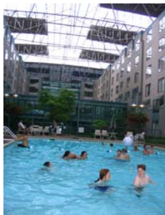
The Pool at the Hyatt Union Station St. Louis