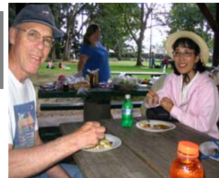
The Irwin's enjoy their lunch at the South End Picnic