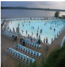
Raging Rivers Water Park along the Mississippi