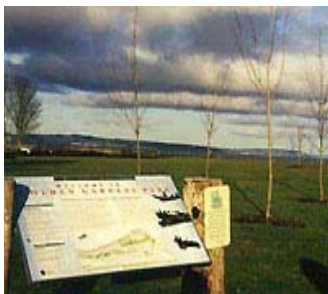
Golden Garden's Park in Seattle