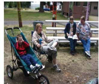
Sitting around the campfire