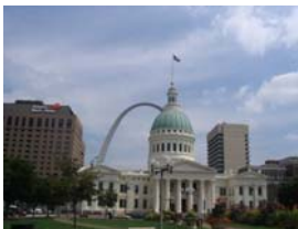
Historical Old Courthouse & Arch