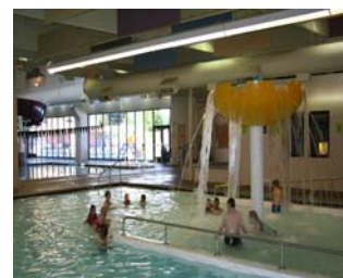
The heated pool at Shute Park South End Picnic